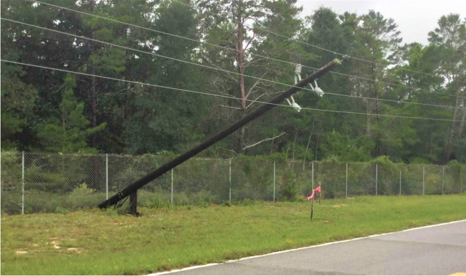
A fallen power line leans over the highway following Hurricane Sally in September 2020. Always stay away from downed lines and call 911.

Thunderstorms, hurricanes, tornadoes and flooding often leave behind more than damage. In many cases, they can leave hidden dangers that could be life-threatening.